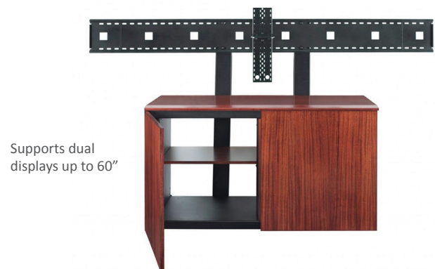
Supports dual displays up to 60"