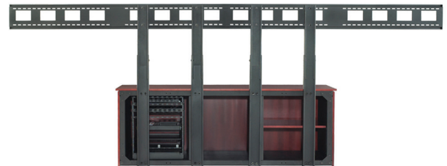
Custom option mount for three displays