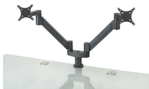
Dual, articulating display arm (DMA)