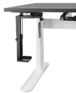
Rotating CPU Arm (CPU-P)