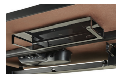
Rotating CPU Arm (RMB)