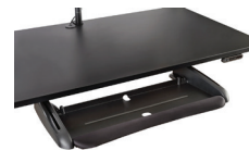
Rotating CPU Arm (KT)