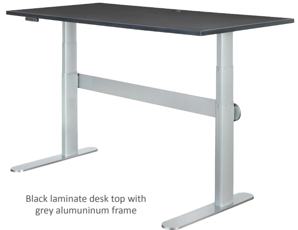
Black laminate desk top with grey aluminum frame