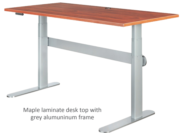
Maple laminate desk top with grey aluminum frame