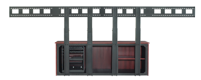
Custom option mount for three displays