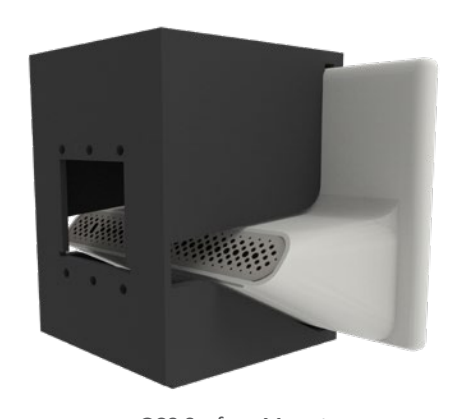
GC8 Surface Mount back view