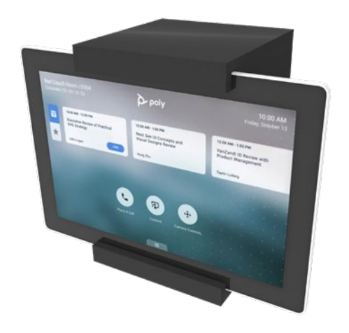
GC8 Surface Mount with GC8 panel