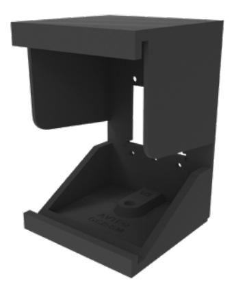
GC8 Surface Mount