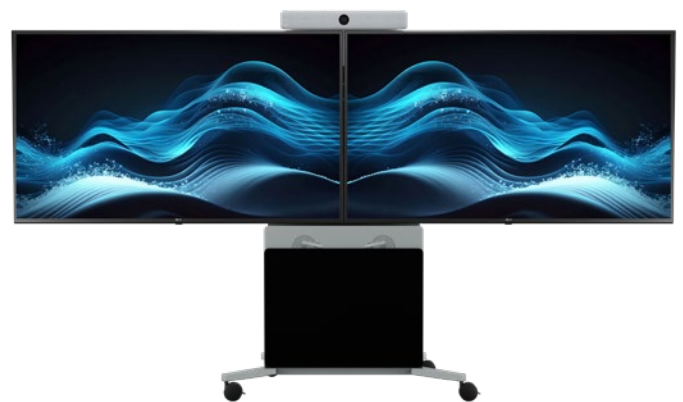
ELT-2100 with dual displays