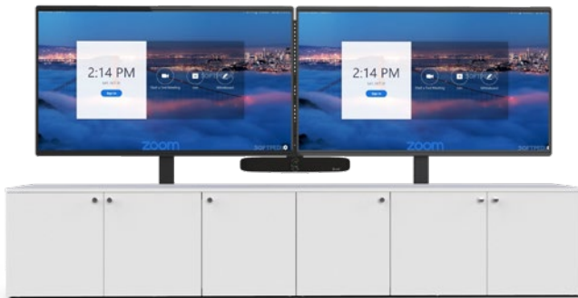
6-bay credenza with dual 86 inch displays