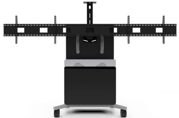
ELT-2100L with the VMPU-100L-120