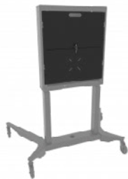
Lockable Rear Cover AVT-481A92