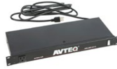
6 Port Surge Protector RCK-PWR