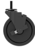
Heavy Duty 6" Casters HDC-6