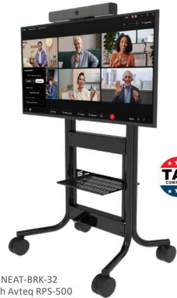
NEAT-BRK-32 with Avteq RPS-500