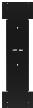
Neat Bar Mount Bracket