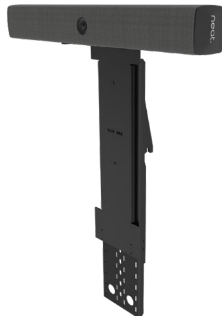
NEAT-BRK-24 with Neat Bar