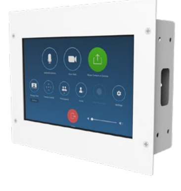
In-Wall Mount (LTAP-WMP)