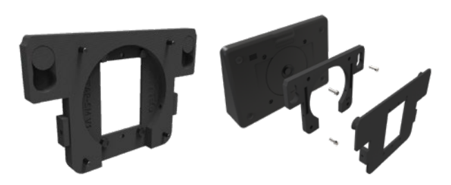
Surface Wall Mount