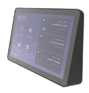
Surface Wall Mount (LTAP-SM)