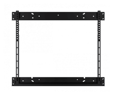
VESA Adapter 200x200 up to 800x600