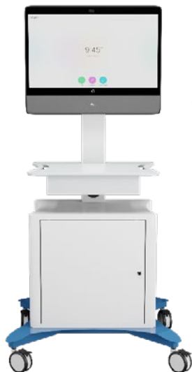
TMP-300 with the Cisco Desk Pro