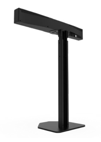
CAMERA-STAND-PTZ back view with Yealink A30 MeetingBar camera, not extended