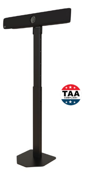
CAMERA-STAND-CRK extended with Cisco Room Bar camera