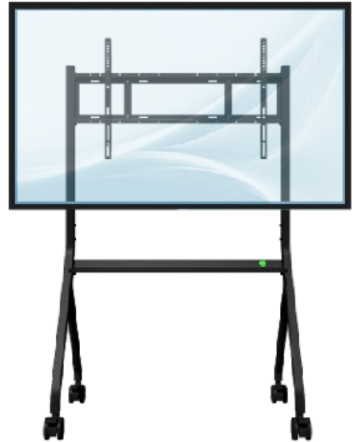
Mobile Stand Base with VESA mount and display