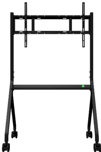
Mobile Stand Base with VESA mount