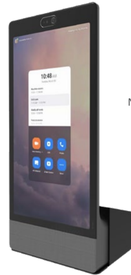
Neat Frame Wall Mount Front angled view