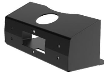
Wall Mount Back view