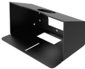
Wall Mount Front view