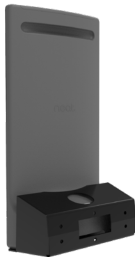
Back view with Neat Frame device