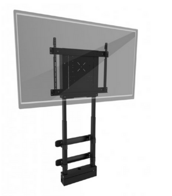
DynamiQ mMount II with display