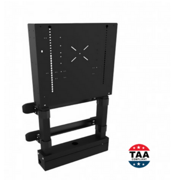
DynamiQ mMount II