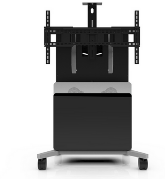
ELT-2100S Mobile Cart for dual displays