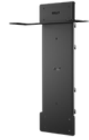
Logitech Rally Bar Mount LRC-MOUNT-24 | LRC-MOUNT-32 LRC-MOUNT-42 | LRC-MOUNT-48