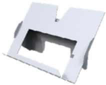
Logitech Tap Cradle LTAP-MNTKIT