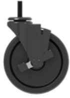
Heavy Duty Casters HDC-6