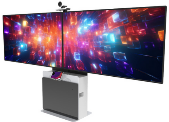
ELT-2100L-B Floor Stand for dual displays