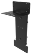
Yealink MeetingBar YEA-24 | YEA-32 | YEA-42 | YEA-48