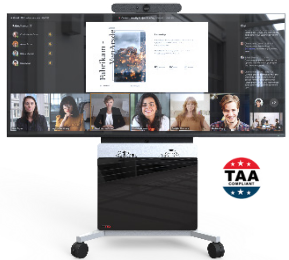
ELT-2100S for single displays