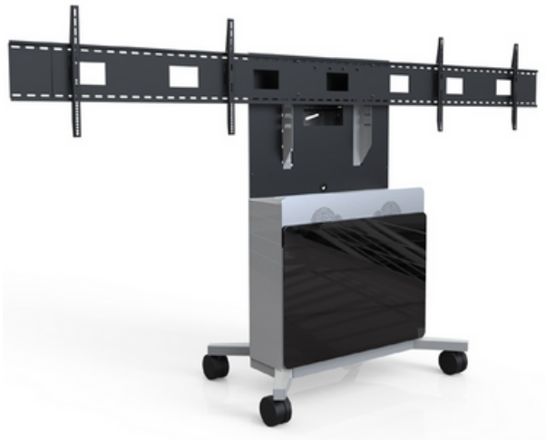
ELT-2100L Mobile Cart for dual displays