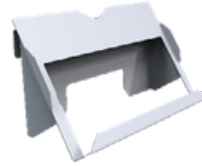
Poly TC8 Cradle TC8-MNTKIT