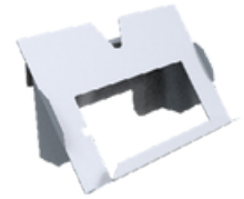
Cisco Room Navigator Cradle CN-MNTKIT