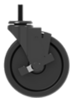
Heavy Duty 6" Casters HDC-6