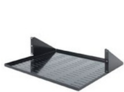
Additional Accessory Shelf RPS-AS5